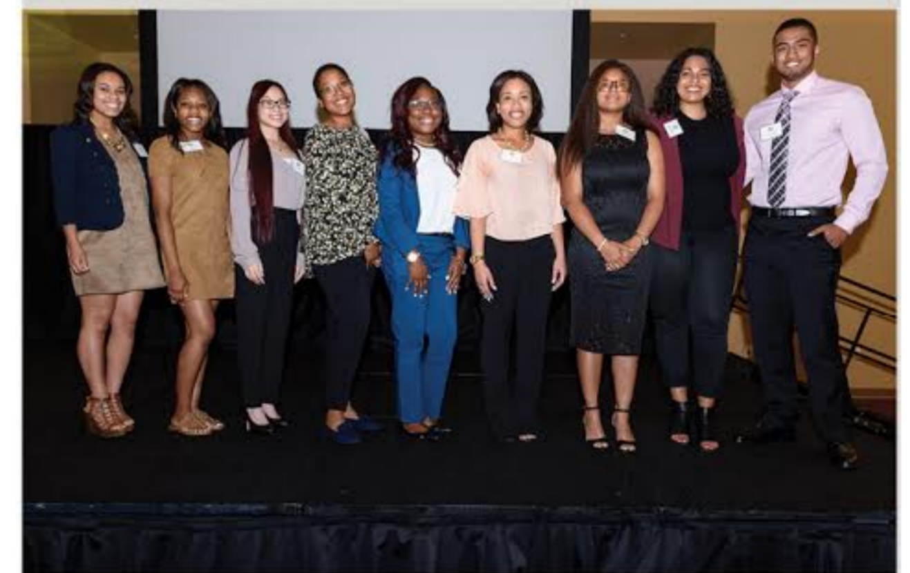
Scholarship recipients at our April 18, 2017, Scholarship Luncheon. Over one-hundred guests attended including supporters of our annual and endowed scholarships.

THANK YOU FOR SUPPORTING XAVIER UNIVERSITY!